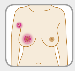
Pain in your breast or your armpit that's there all or almost all the time