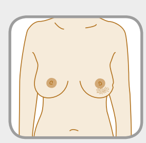
A change in skin texture such as puckering or dimpling (like the skin of an orange)