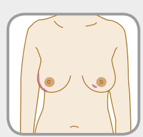
A lump or area that feels thicker than the rest of the breast