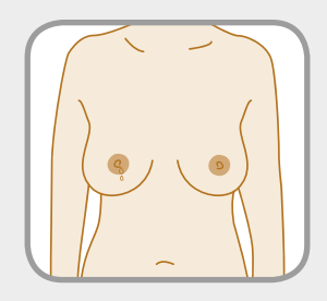
Liquid that comes from the nipple without squeezing